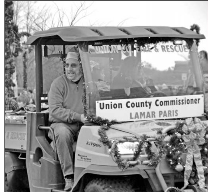
Union County Sole Commissioner Lamar Paris

enjoying the simple pleasure of a close-knit community coming together for the holiday season.