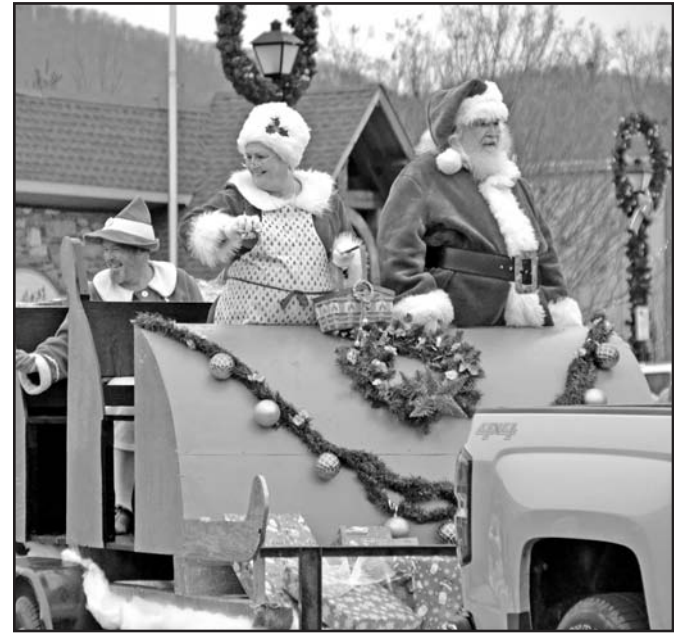
Santa and Friends waved and tossed candy to the youngsters of Union County on Saturday, Dec. 3.

Girl Scouts, Boy Scouts, Cruisers, churches and all those excited to participate in celebrating the season joined in on the parade, waving to friends, family and neighbors, and